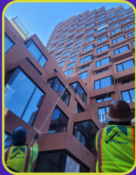
The team working on The Canyon