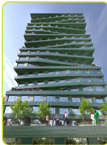
Rendering of the second residential building