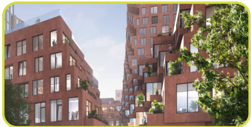
Rendering of The Canyon

We have a lot to look forward to in 2023 at Mission Rock. The first residential building, The Canyon, will start welcoming tenants in the late spring, the second residential building will top off in the summer, streets are coming together, and we’re gearing up for the first tree plantings in China Basin Park in March.