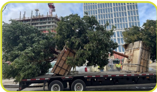
Delivery of Arbutus Marina trees for China Basin Park