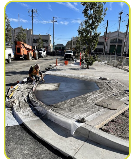
Curb ramp paving on Toni Stone Crossing