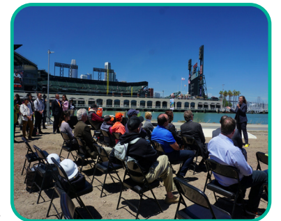
China Basin Park celebration