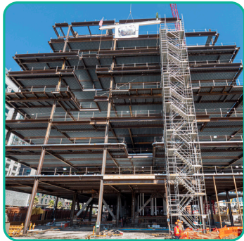
Parcel B Topping Out