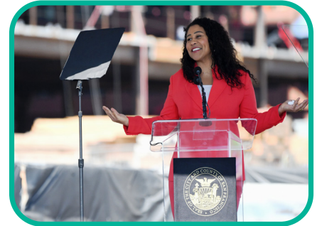
Mayor Breed at the State of the City